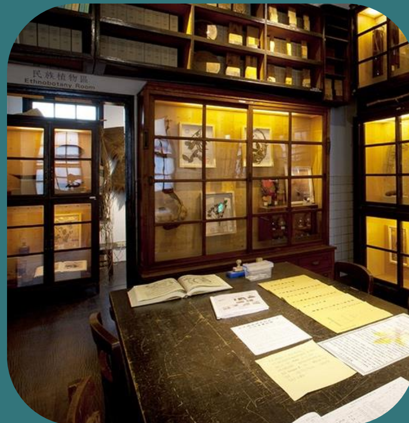
– TAI HERBARIUM –