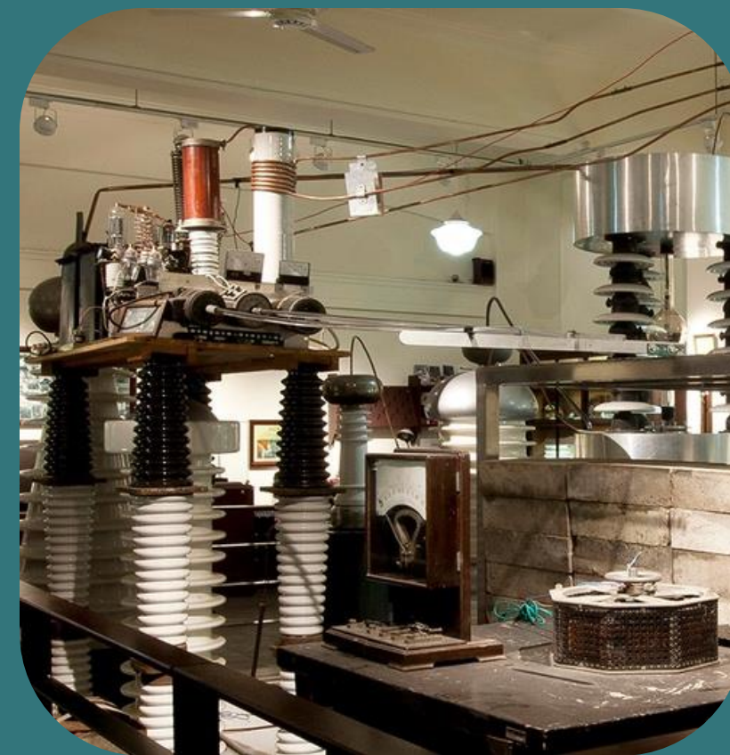
– HERITAGE HALL OF PHYSICS –