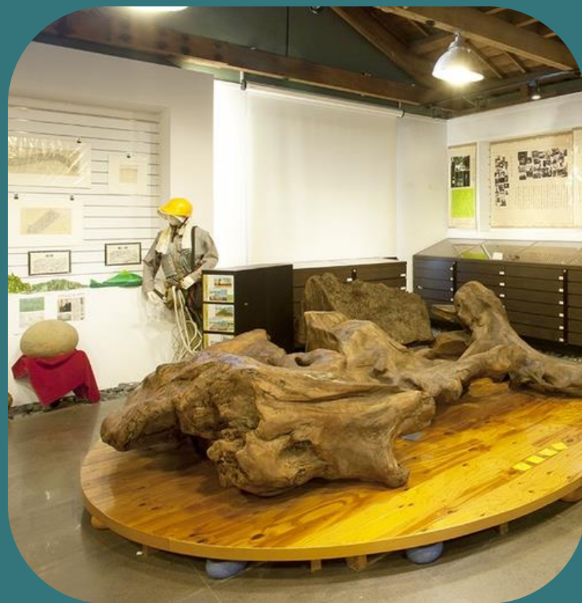
– GEO-SPECIMEN COTTAGE –

– SELF-GUIDED VISIT: FOUR MORE NTU MUSEUMS OPEN UNTIL 17:30 –