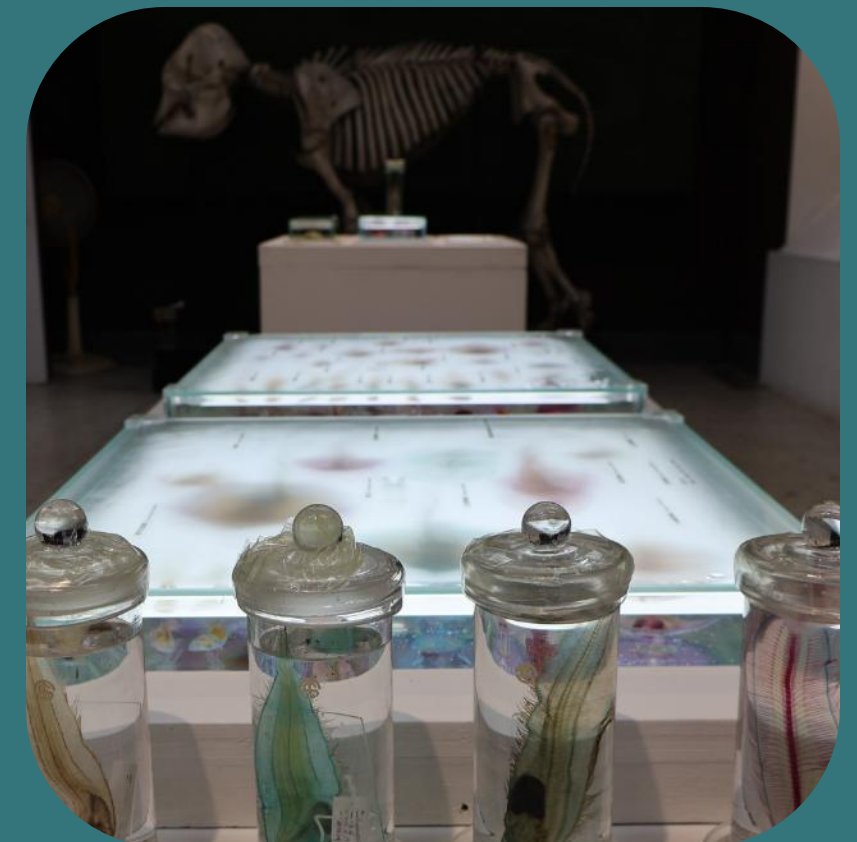
– MUSEUM OF ZOOLOGY –